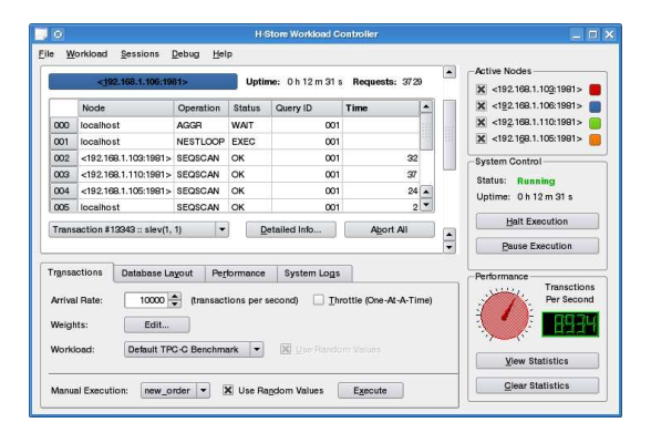
Figure 2: The graphical interface of the H-Store controller allows users to dynamically change properties of the running sample application and change the physical layout of the database.

schemes and workload generation parameters.