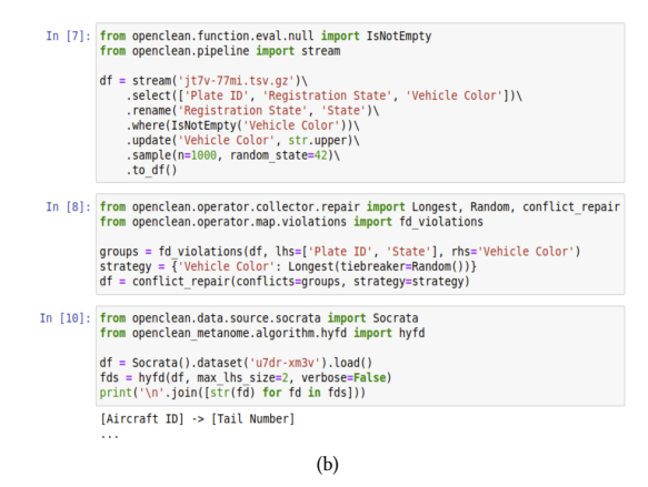
Figure 2: (a) The openclean interface in a Jupyter Notebook allows users to inspect the contents of a dataset in the spreadsheet view (B), including column statistics and data types. The recipe view (A) captures the series of operations applied to the data. Users can register user-defined functions and later apply them through the visual interface. (b) Use of openclean for functional dependency violation repair.

environment allows users to more easily integrate data cleaning tasks with their data science pipelines. In addition to the ability to leverage existing libraries, openclean provides a spreadsheet-like GUI shown in Figure 2(a), which enables users to visualize and interact with the data from a Jupyter Notebook.