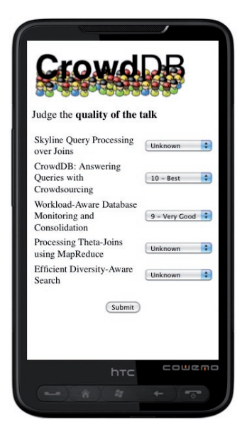
Figure 3: Mobile Task.