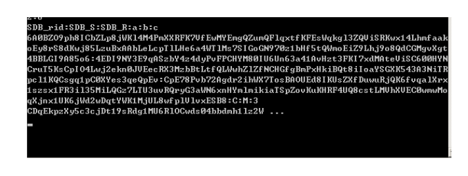
Figure 4: Machine M_{SP} : Memory dump at the service provider

In this step, the attendee will be invited to use M_{DO} to submit queries from the data owner side to SDB. The attendee will first open a query view of the secured database D_1 (Figure 3) and then she can pose any SQL queries. The page will show the rewritten query that is actually executed by the server. The attendee will also be invited to note the query execution time that is broken down into a client cost and a server cost. Specifically, the client cost is composed of query parsing time, query rewriting time, and result decryption time. In the demonstration, we show that these costs are subtle compared with the total cost.