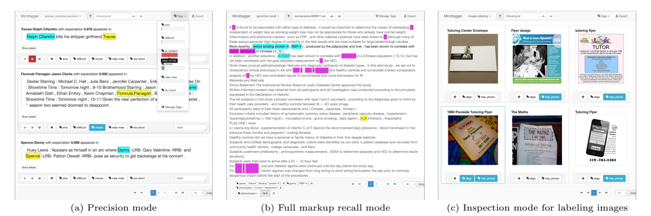
Figure 2: Screenshots of Mindtagger operating in three different modes.

identify possible improvements and assess their potential impact in a principled way.