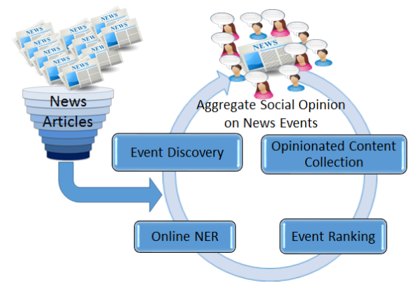
Figure 1: Information flow and main components of FLORIN

Proceedings of the VLDB Endowment, Vol. 8, No. 12 Copyright 2015 VLDB Endowment 2150-8097/15/08.